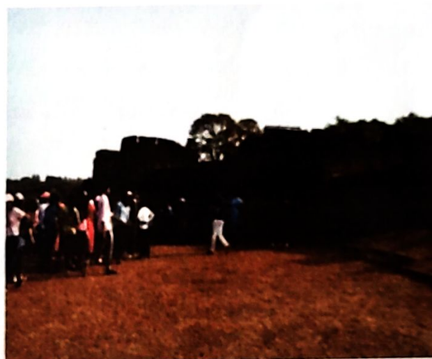
B. Sc. I and B. Sc. II students at Sindhudurg