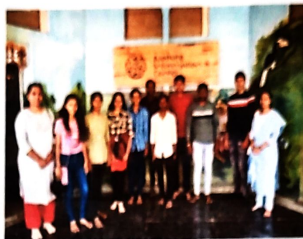
Students at Radhanagari Wildlife Sanctuary